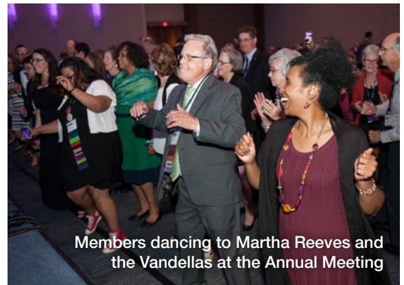
Members dancing to Martha Reeves and the Vandellas at the Annual Meeting

Your membership matters. Thank you for being a part of this effort.