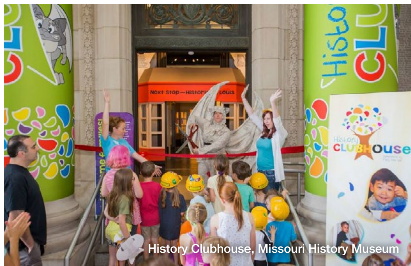
History Clubhouse, Missouri History Museum

Nomination: for the project Wetlands & Waterways: The Key to Cahokia