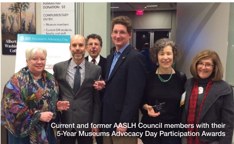
Current and former AASLH Council members with their 5-Year Museums Advocacy Day Participation Awards