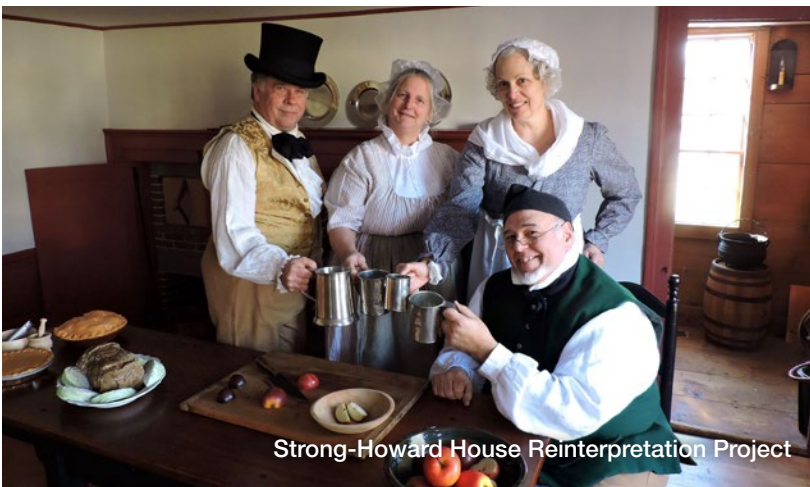
Strong-Howard House Reinterpretation Project