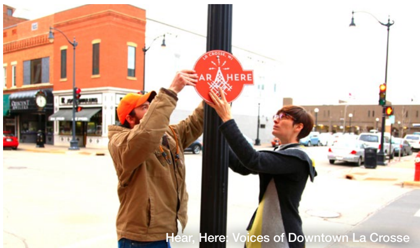
Hear, Here: Voices of Downtown La Crosse