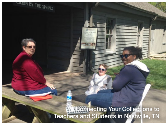
Connecting Your Collections to Teachers and Students in Nashville, TN