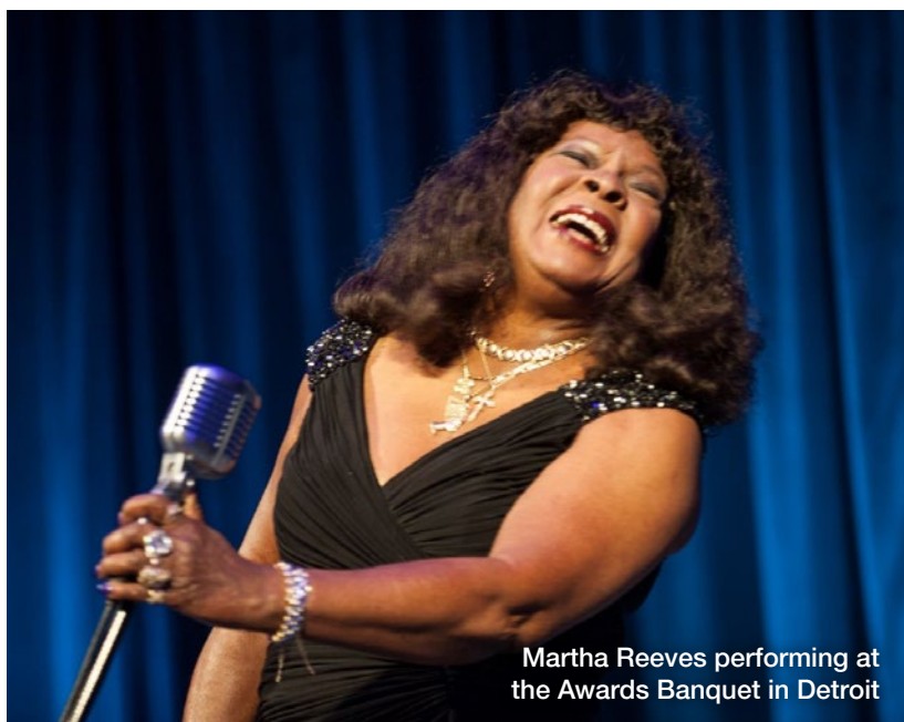
Martha Reeves performing at the Awards Banquet in Detroit