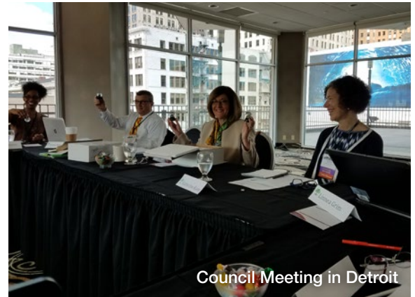
Council Meeting in Detroit