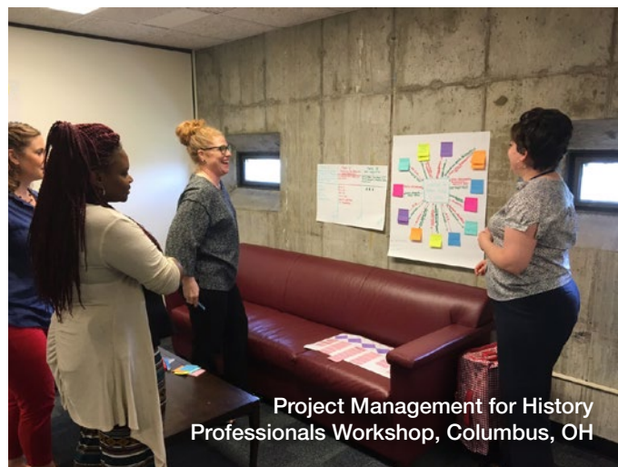
Project Management for History Professionals Workshop, Columbus, OH