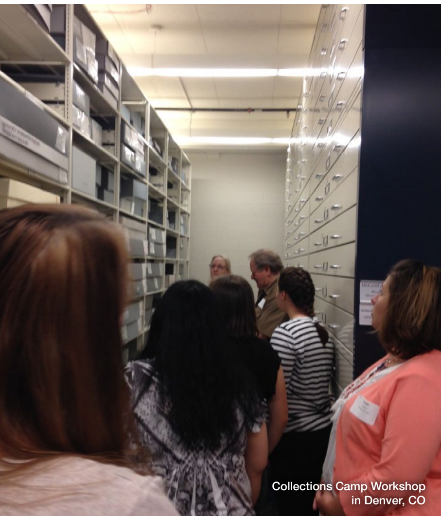
Collections Camp Workshop in Denver, CO