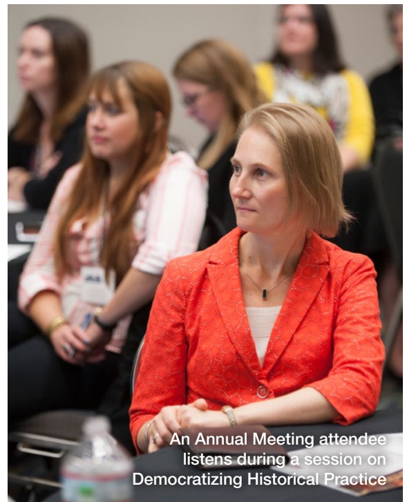
An Annual Meeting attendee listens during a session on Democratizing Historical Practice