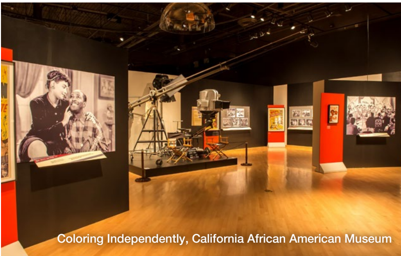
Coloring Independently, California African American Museum