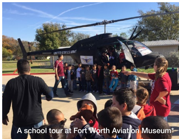
A school tour at Fort Worth Aviation Museum*