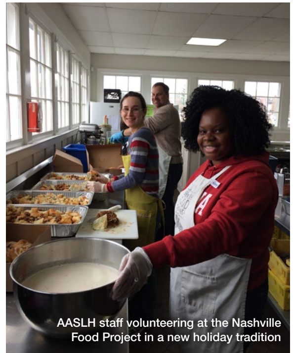
AASLH staff volunteering at the Nashville Food Project in a new holiday tradition