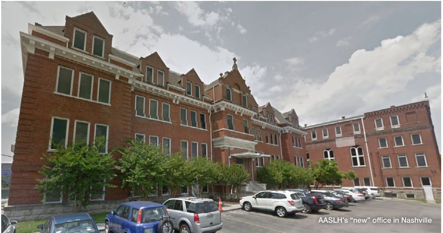
AASLH's "new" office in Nashville

While 2015 was a year of transition for AASLH, 2016 was one of building upward and outward. In the first quarter of the year we successfully reached our 75th anniversary fundraising goal of raising $75,000 for the 75 for 75 Campaign (thank you to all who contributed). The infusion of these funds and healthy revenue from membership, marketing, annual meeting, and other programs allowed AASLH to expand in several ways. In April, we unveiled a new membership database and association management system that operates at the core of almost everything the AASLH staff and volunteers do. In June, we increased the staff size from eight to nine by creating a new position for coordinating AASLH's continuing education efforts, thereby meeting the growing demand for workshops and webinars. Over the course of three busy days in October, not long after the 2016 Annual Meeting, the AASLH staff moved the office to a new location in Nashville, thus completing a long series of major and minor infrastructural improvements throughout the year. Our new historic office is in the former St. Bernard's Convent, which was built in 1905. It has half the square footage, but feels more spacious and inspiring, and will save the organization over ten thousand dollars a year.