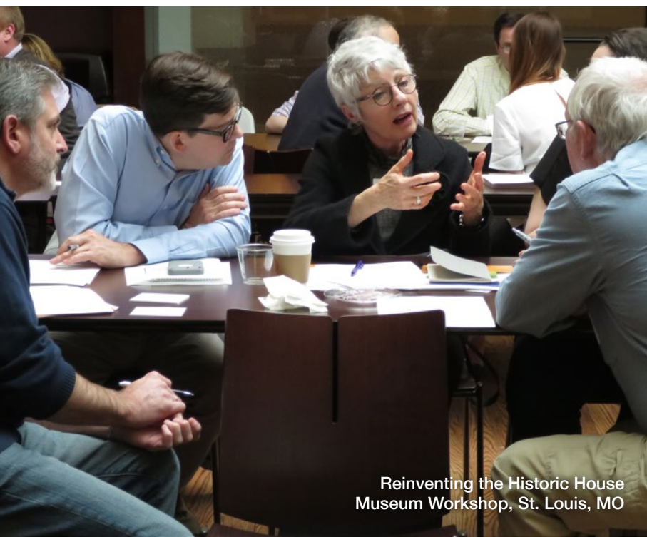
Reinventing the Historic House Museum Workshop, St. Louis, MO